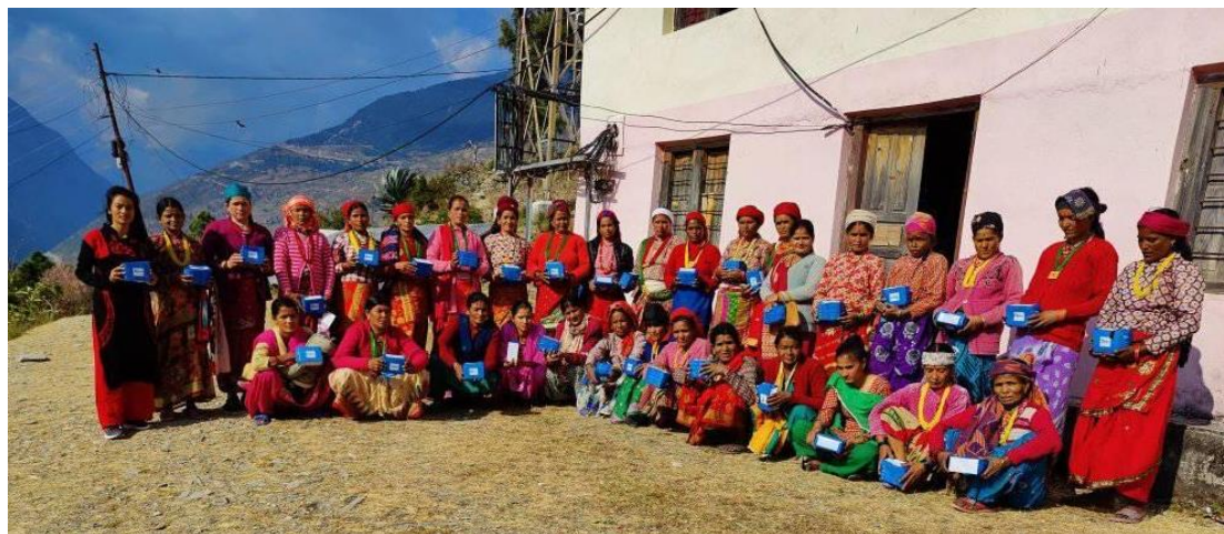
Mothers having received Baala pads

In the meantime, we have now found and hired an excellent and reliable nurse who is teaching the girls, and all in all the project is now off to a good start. We have educated the schoolgirls and -boys in many schools already, based on the brochures, and have been providing the girls and their mothers with pads. We were happy to note that a recent radio program in Bajhang greatly praised our project, quoting the mothers as being very happy to have received the washable pads and asking if we could extend our project to cover all women in Bajhang. We, however, do not have the financial resources to do this.