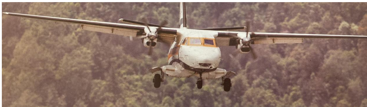
Coming in for landing