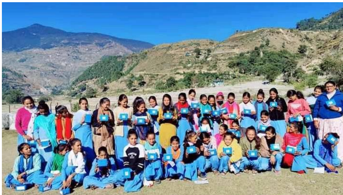
Schoolgirls in Bajhang having received menstrual pads