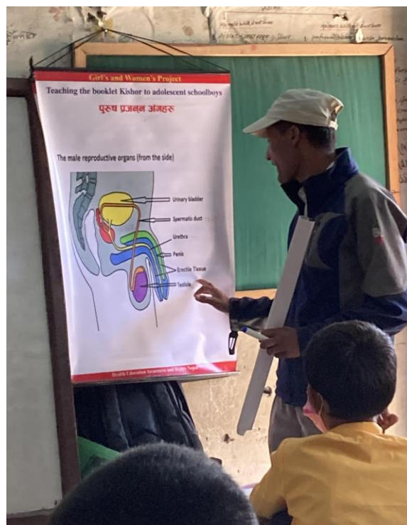
The boys were also taught.