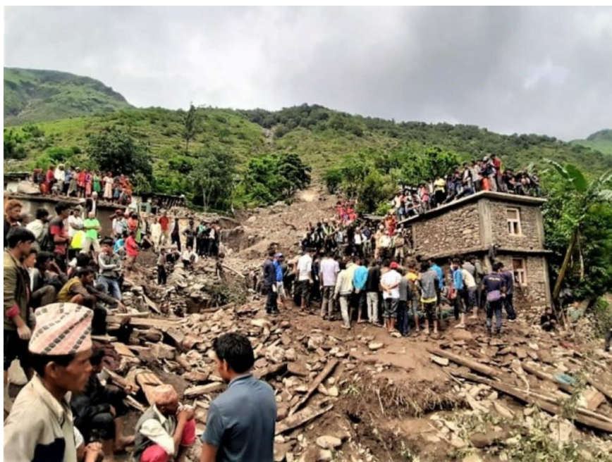
A landslide in Bajhang that killed 23 people

After my arrival in Kathmandu, but before setting off as planned to Bajhang on Oct. 24 th , we got the news that there had been great flooding and several large landslides in Far Western Nepal, resulting in the death of about 150 people, among them 35 in Bajhang.